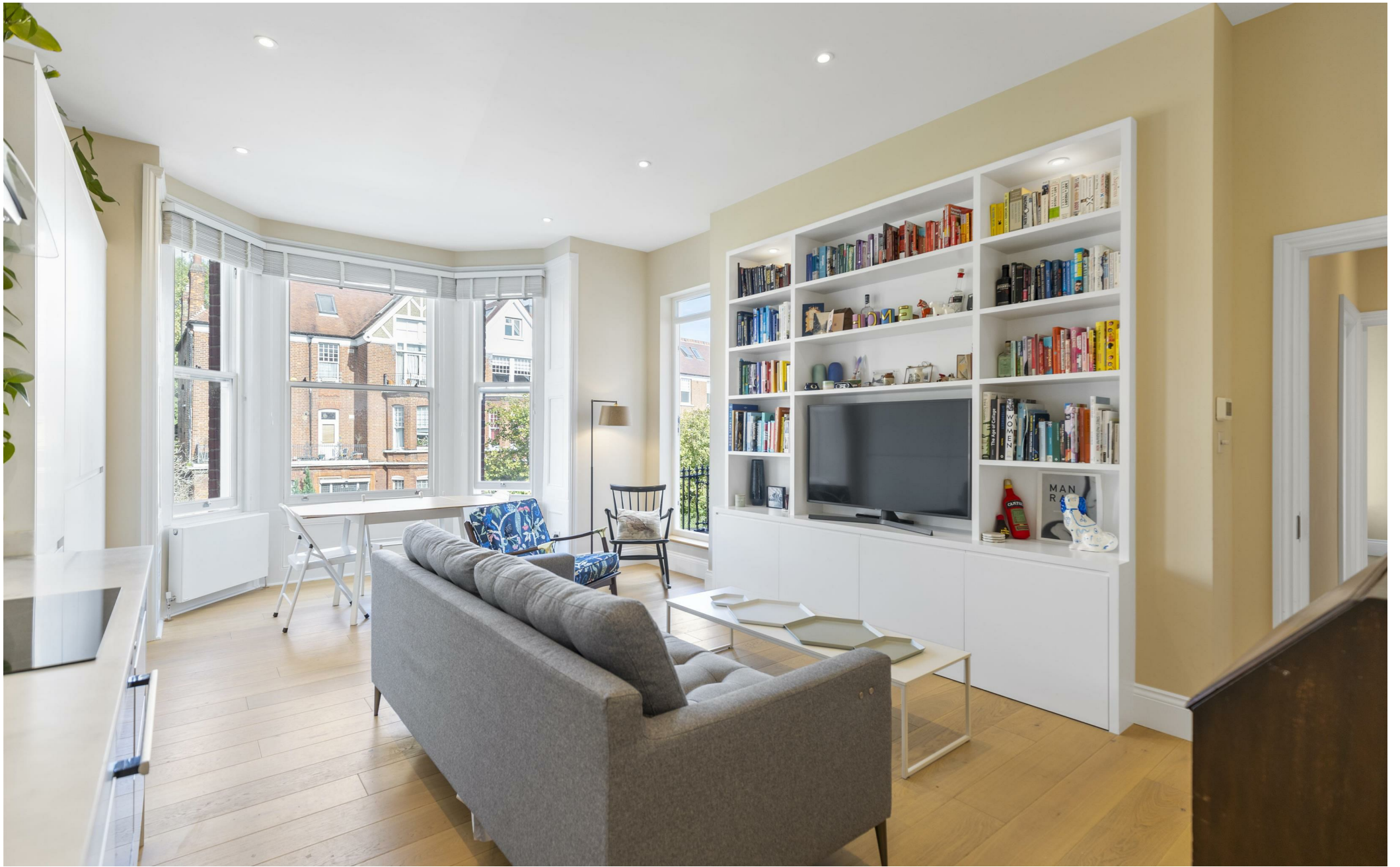
Compayne Gardens NW6